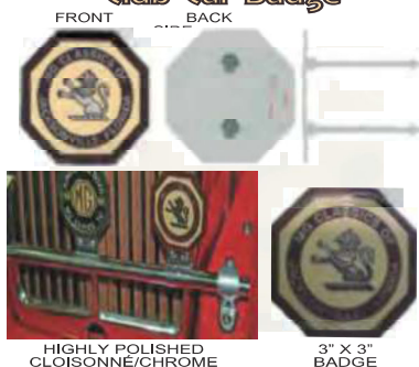
HIGHLY POLISHED CLOISONNE/CHROME

MG Classics of Jacksonville Club Car Badge