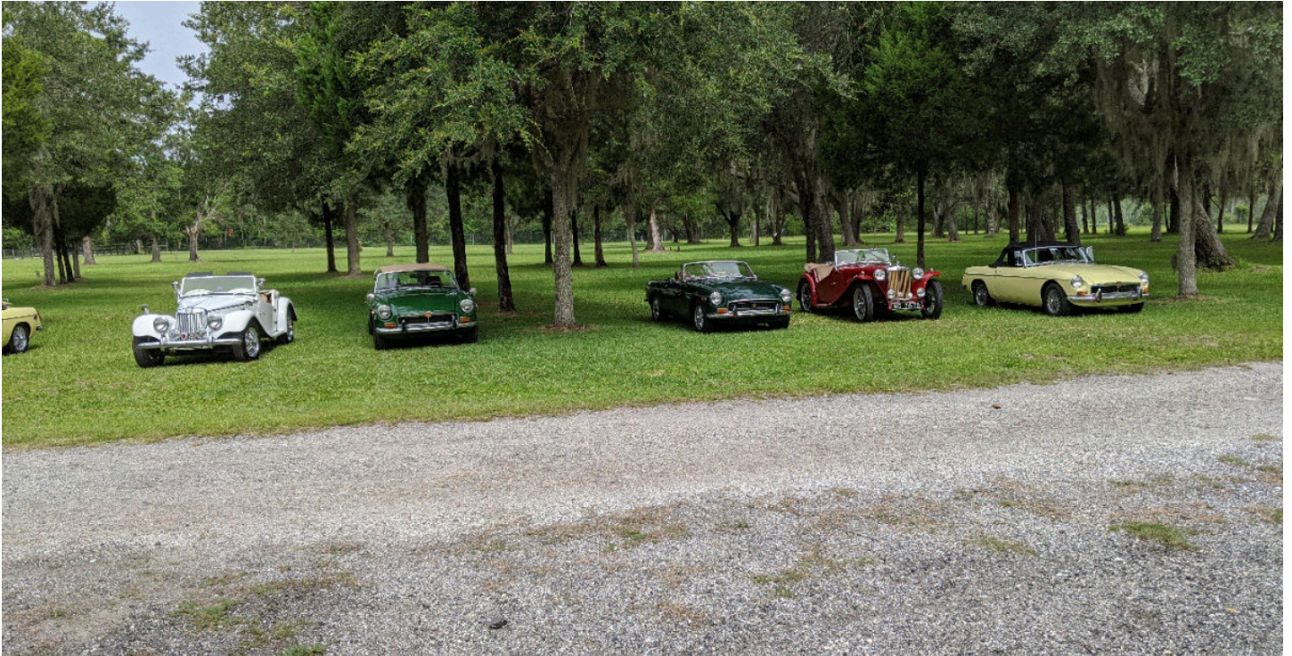
Club member's cars at the Trout Creek Park Picnic on June 20 th 2020