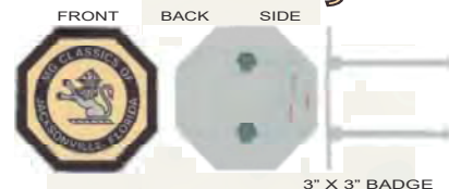
3" X 3" BADGE